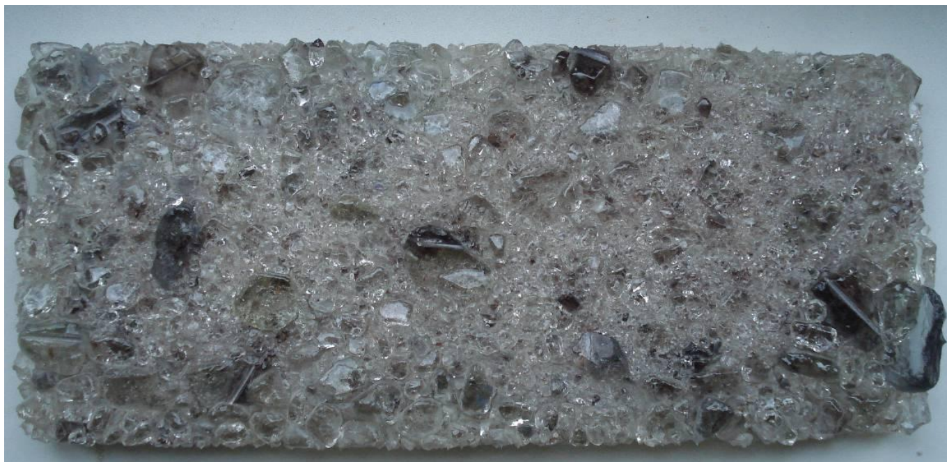
Figure 2: A product made of dismantled screens (cone part – fraction 0 to 16 mm) at maximal temperature of 700 °C.